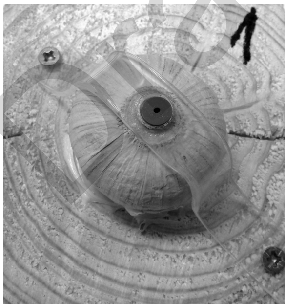
Figure 1. Single clove garlic with attached rubber septum

Penetration of HCN into garlic tissue. The evaluation of the penetration of HCN into garlic cloves was conducted in a hermetic fumigation chamber. Garlic for testing was prepared by hollowing the single cloves of garlic and attaching a rubber septum onto the hollow area (Figure 1). Treatments were conducted in a stainless hermetic steel fumigation chamber equipped with an air lock, forced ventilation and rubber glove manipulators (Figure 2). An image and technical details of this chamber are described in a previous