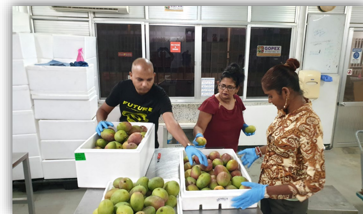
Mango export inspection : packing house