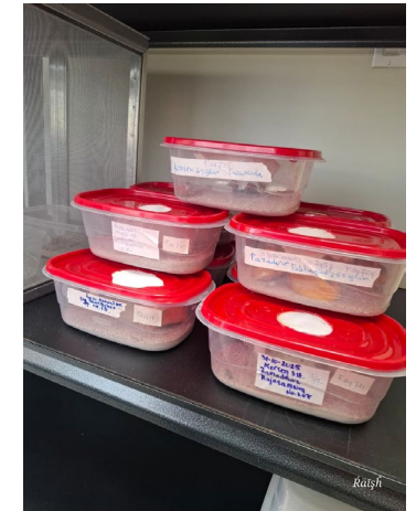
Traps; Fruit collection, Data collection, Lab rearing