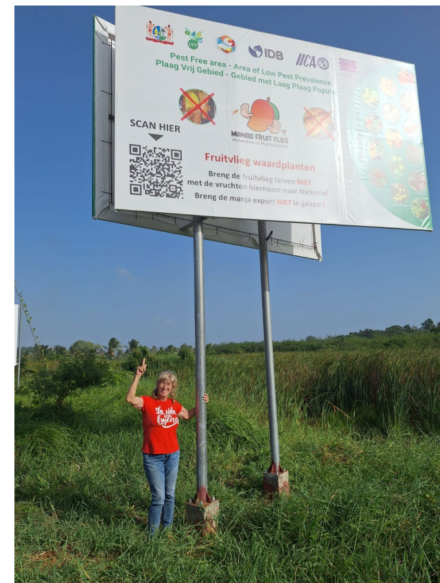
Public Awareness Billboard at the PFA Border with our Fruit fly expert