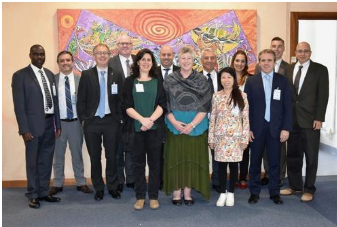
2018 October Meeting of the Focus Group on Commodity and Pathway Standards