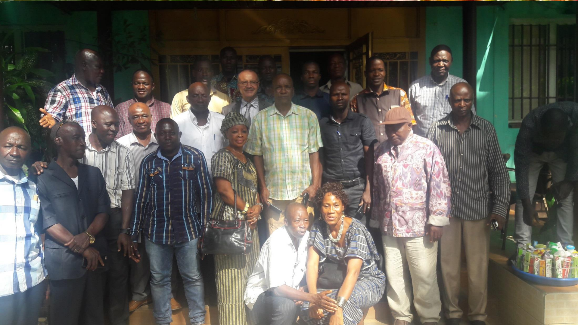
2nd PCE mission to set strategic directions held in Guinea 18-22 June 2017

Protecting the world's plant resources from pests