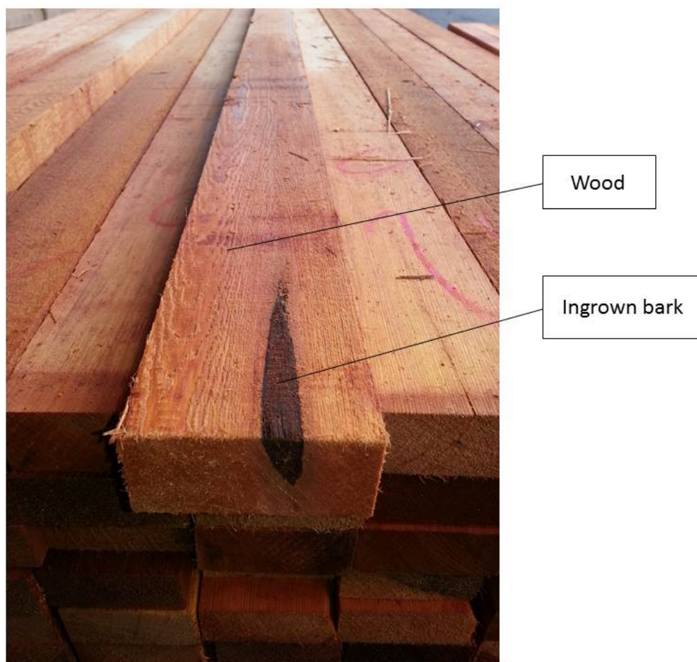
Figure 3. Sawn wood.