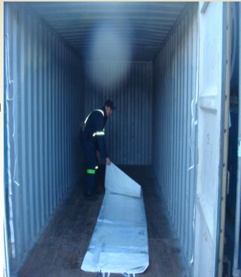
Checking a container